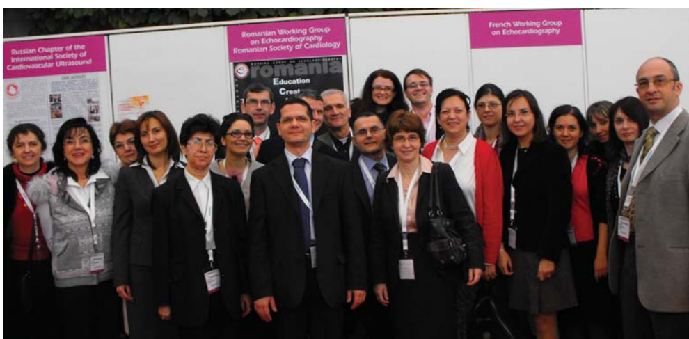
Figure 1 Group of Romanian echocardiographers at the Romanian WGE poster in the International Echo Area at EuroEcho 2010, Copenhagen.

To encourage research, we have introduced in 2009 at the Romanian Society of Cardiology level a system of awards for authors able to publish original research in respected cardiology journals with impact factor (the level of the prize being related